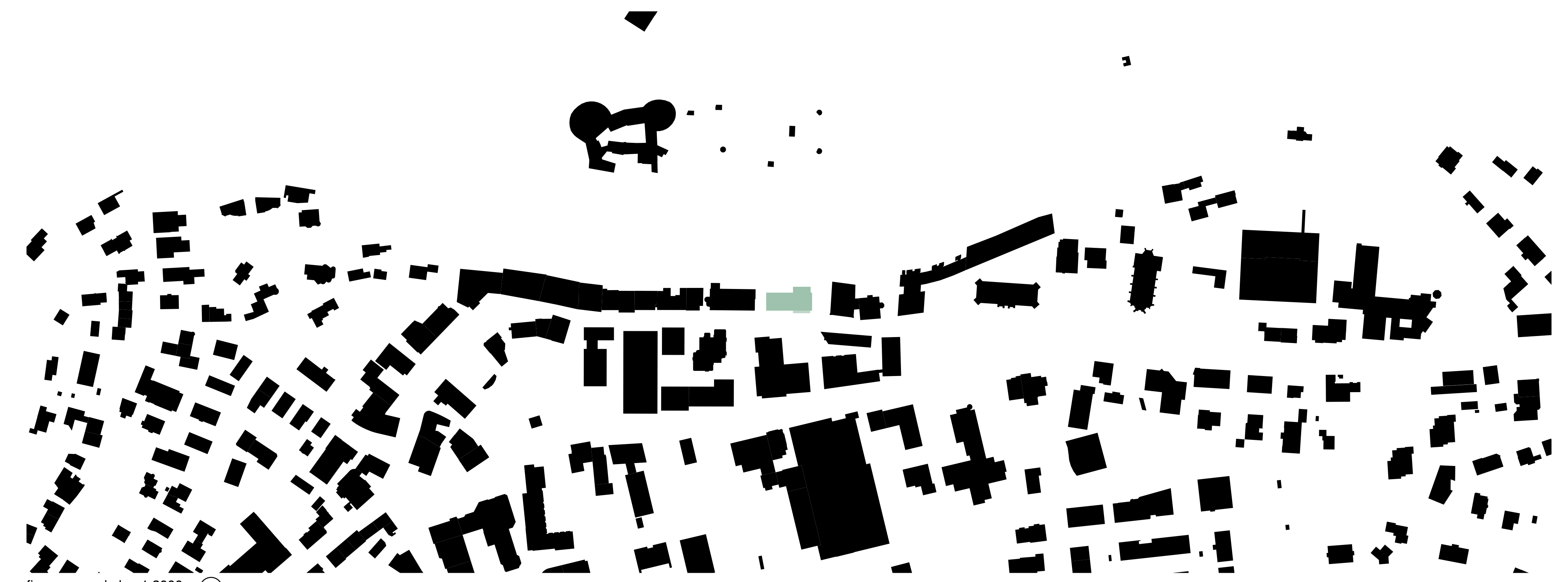
figure ground plan 1:2000