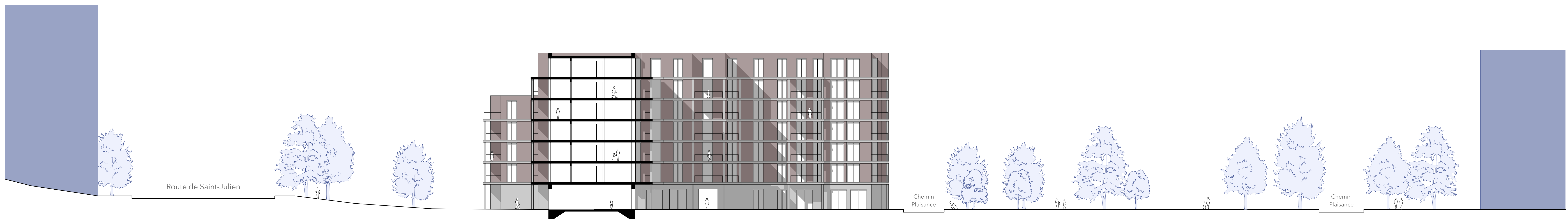
Coupe CC - 1 : 200 ème