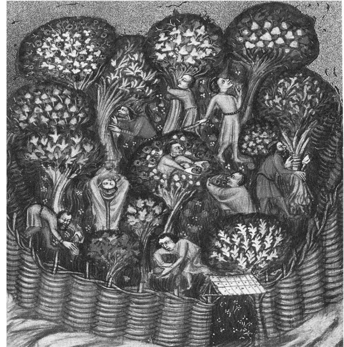
'Orchard' from Bible of Wenceslaus IV (Peter Zumthor, 2011)