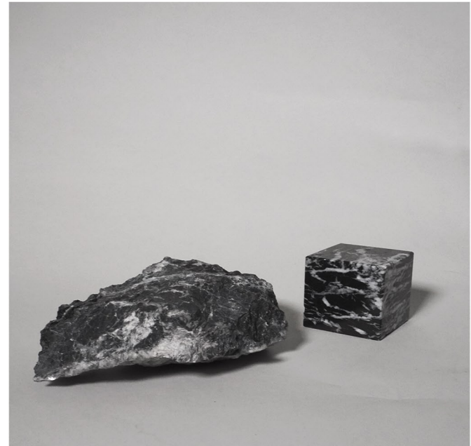
Local materials - balzner limestone.