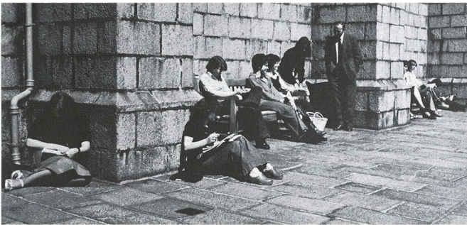
Façade niche as a desired place to stay (Jan Gehl, 2011).